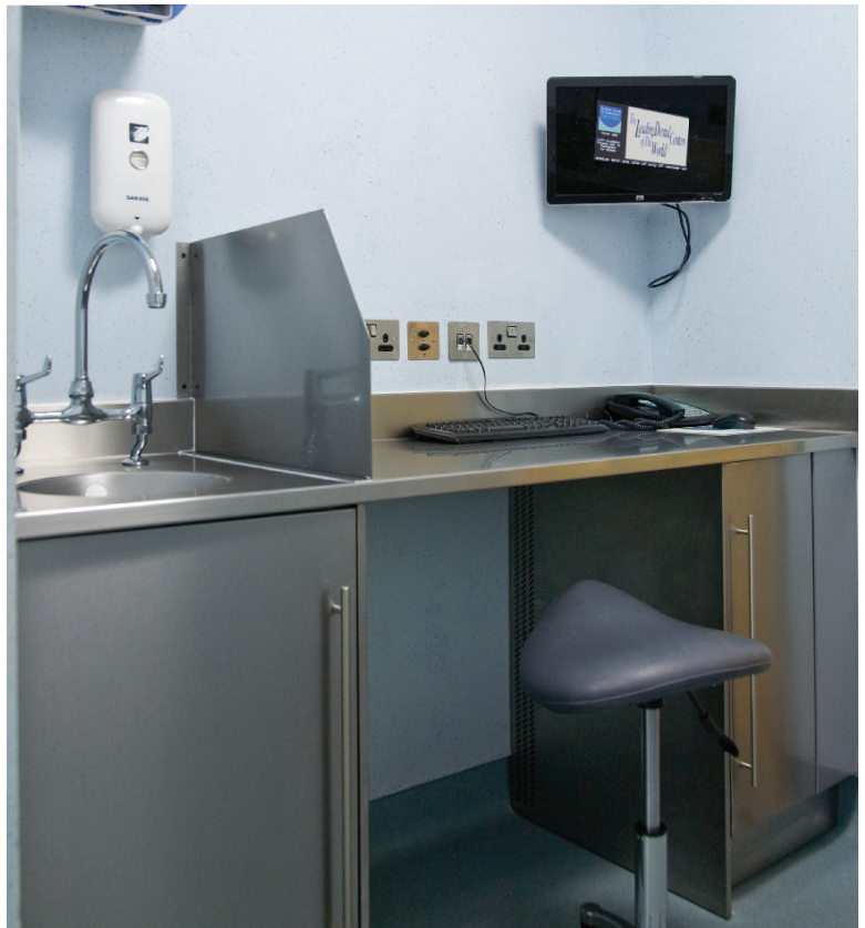
Top left: The branding is visible throughout the centre Top right: The decontamination room Bottom left: The on-site laboratory Bottom right: The decontamination room Opposite page: One of the five surgeries at the centre