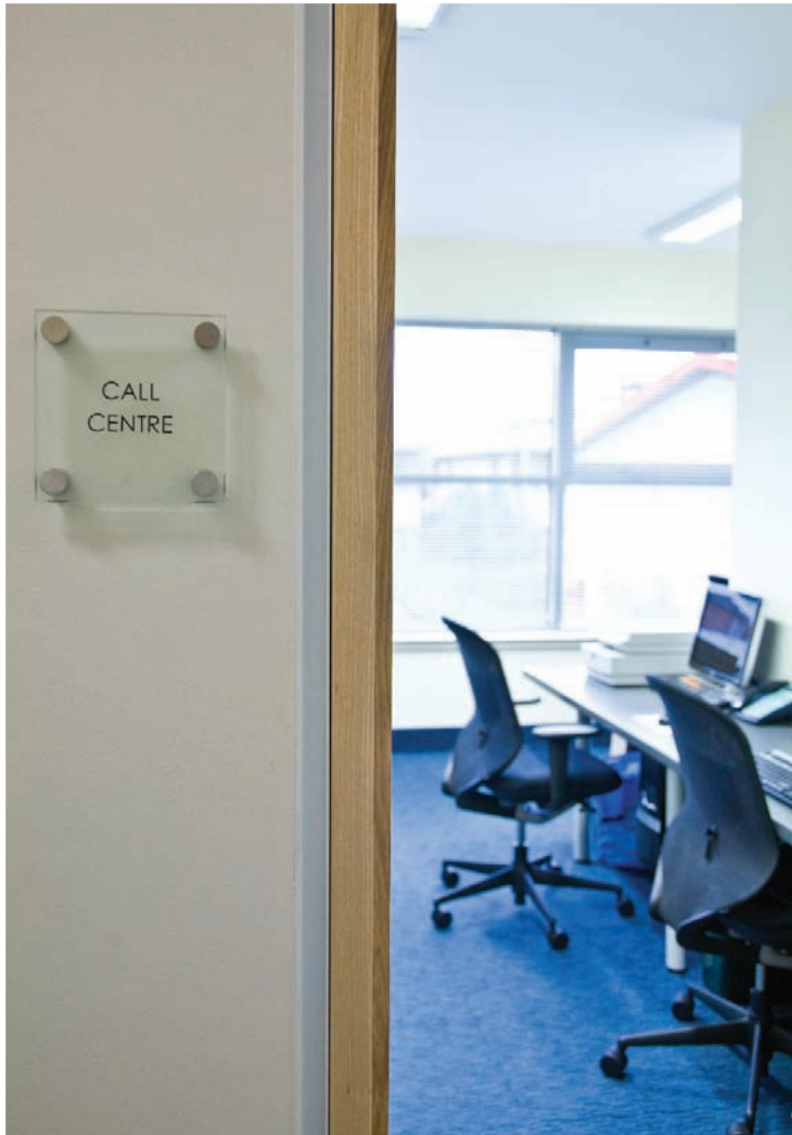
Top left: The main waiting area for patients Top right: The second waiting area for patients Bottom left: The fish tank in the main waiting room is one of Dr Ali's favourite features and provides an eye-catching focal point Bottom right: The Scottish Centre for Excellence in Dentistry's call centre