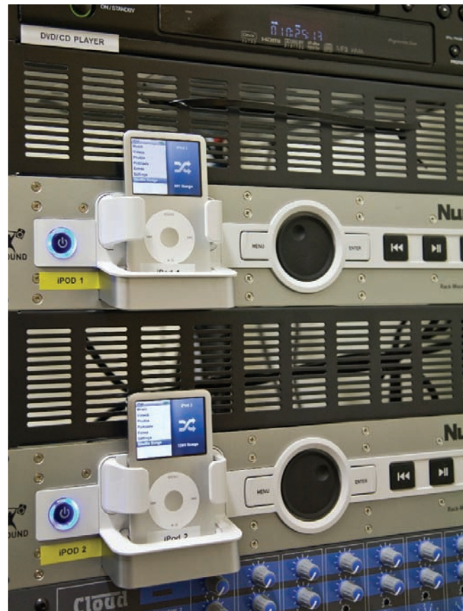
Top: The surgeries at the centre all incorporate state-of-the-art equipment Bottom left: The i-CAT cone beam CT scanner Bottom right: Music is networked around the centre Opposite page: The hypnotherapy room