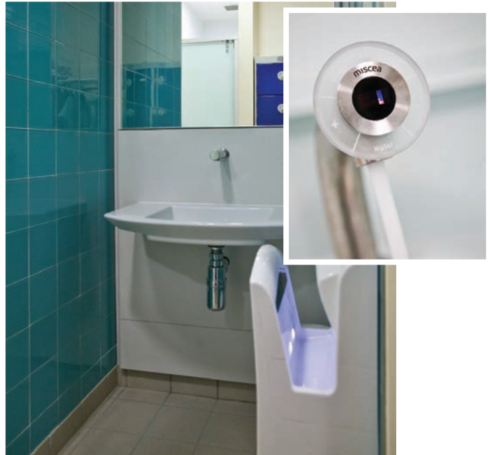
Above: The changing room